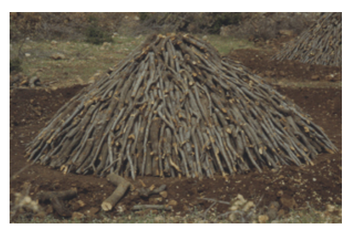
Figure 7.5. Charcoal production in open environment

Cutting of trees resulting in increase in uncontrolled charcoal production in impacted zones is also possible.