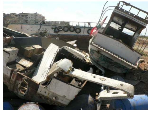
Figure 7.3. Damaged Fishermen Boats at Ozai Port-Beirut