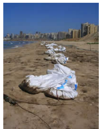
Figure 7.2. Oil waste collection bags

In other cases, it was reported that PVC containers were used as temporary storage for removed oil waste which adds to the problem of final waste disposal. Stored oil waste tends to emulsify making it very difficult or impossible to be emptied. Incineration of PVC containers can lead to the production of dioxins due to the presence of chlorine. The Danish EPA found that doubling PVC feed in an incinerator increased dioxin levels by 32 percent (Hammer, 1998).