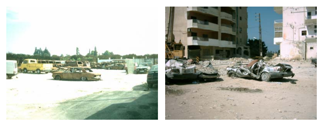
Figure 7.9. Damaged Vehicles from Conflict-South Lebanon

5- Despite the fact that no figures are available on the number of damaged vehicles and trucks, it is estimated that hundreds were damaged during the conflict ranging from small passenger cars to large six wheel trucks (Figure 7.9).