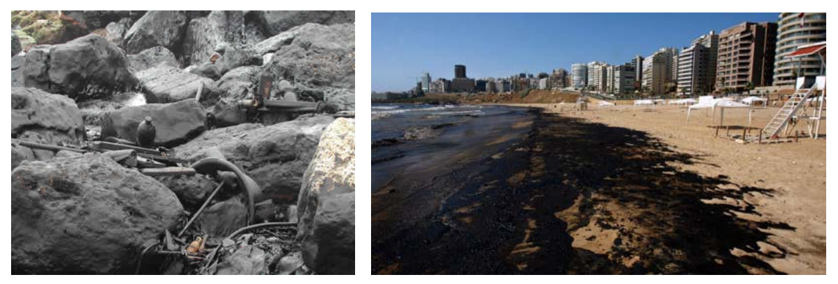
Figure 7.1. Beach Sand and Solid Waste Contaminated by Oil Spill at Ramlet Al Baydeh-Beirut