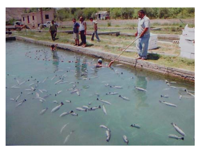
Figure 7.4. Dead trout fish stocks in aquaculture farms at Assi River-Hermel