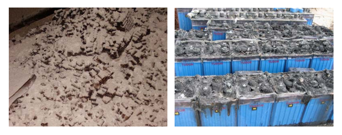
Figure 7.7. Partially Incinerated Dry and Liquid Batteries in Plastimed and Jiyeh (from left to right)