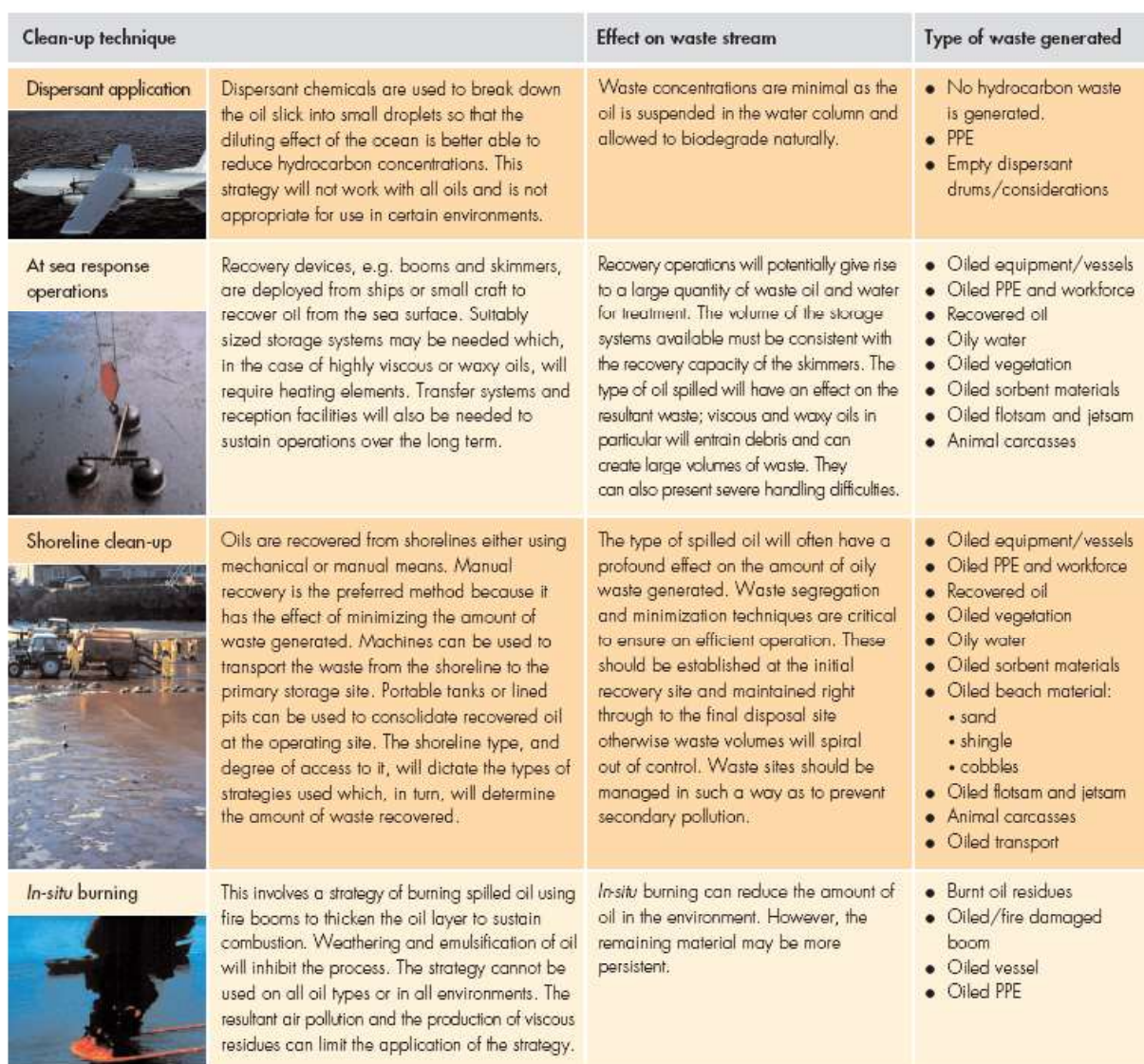
Table 12 : Response strategies and their effects on waste generation

Source IPIECA, guidelines for Oil Spill Waste Minimization and Management, Report Series, vol. 12.