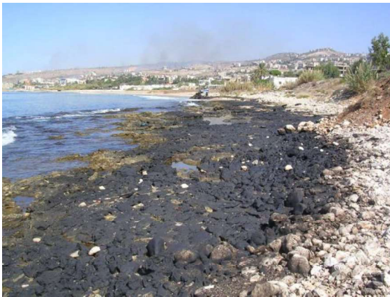
Oiled cobble and rocky shore

Approximately 10,000 to 15,000 tons of unburned fuel oil were spilled at sea, and drifted to the north, pushed by south-westerly winds. The pollution impacted almost half of the 200 km of Lebanese coastline, affecting various substrates: sand, stones, rocks, port facilities. The product spilled appeared to be an IFO 150 (Intermediate Fuel Oil).